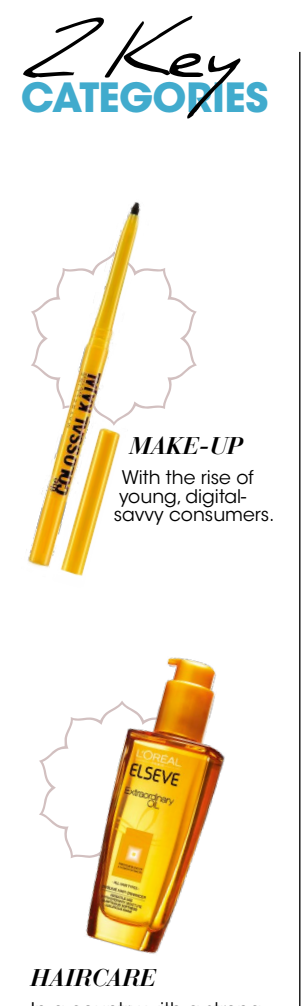
In a country with a strong oil tradition.

(1) Source: Turkish Statistical Institute (TUIK), 2014. (2) Source: Nielsen panel, mass-market. (3) Source: Internal data, sell-in. (4) Source: IPSOS study. (5) Source: Seomoz.com and Google data