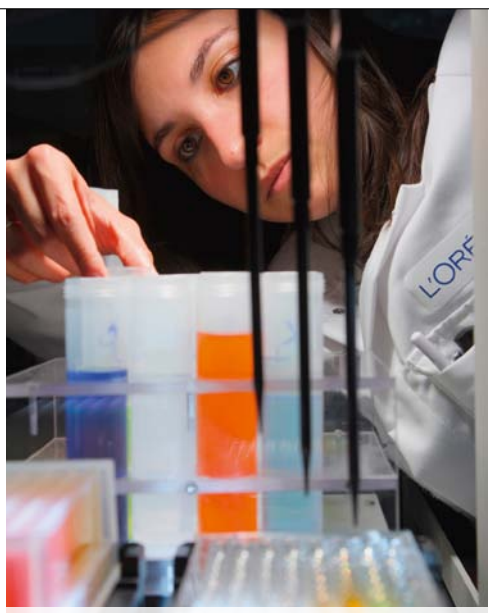
Researcher in a laboratory evaluating the ecotoxicity of raw materials.

(4 This is our very first duty: to offer our consumers not only the best products in terms of efficacy, quality and safety, but also the most responsible products, that is products designed to be ecologically and socially responsible. By 2020, we are committed to ensuring that 100% of our new products provide an environmental or social benefit. And that benefit must be quantifiable, measurable and verifiable. ?? J.-P. Agon