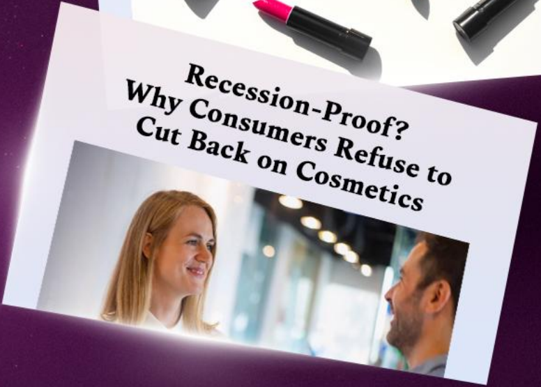
GLOBAL FINANCIAL CRISIS